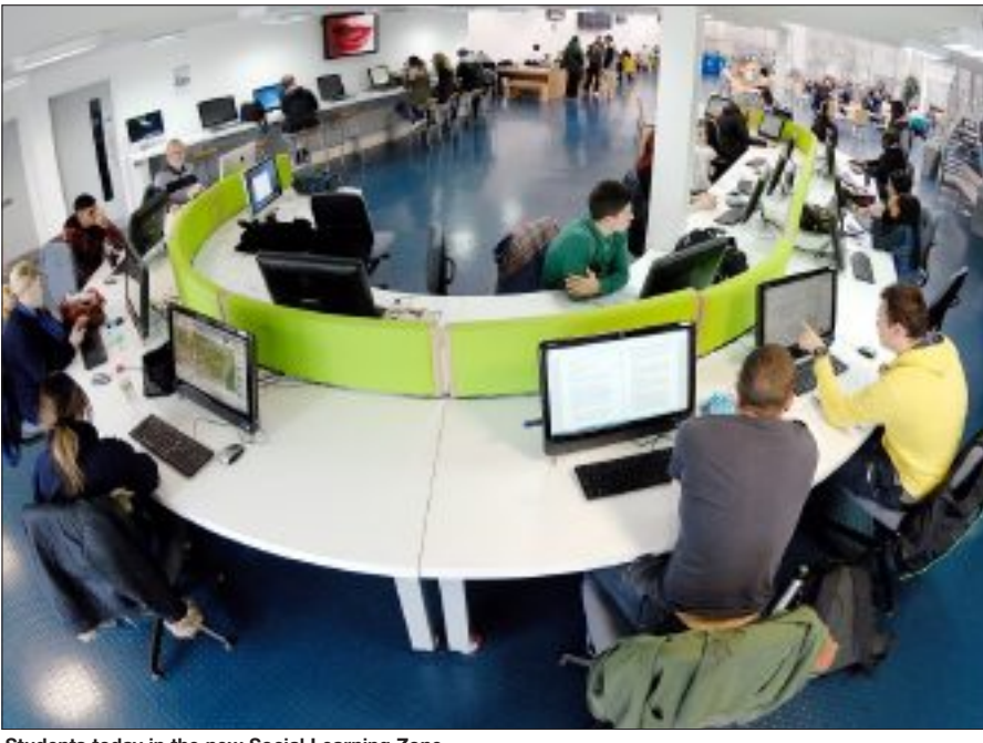
Students today in the new Social Learning Zone

Throughout the 1990s, the number of degree subjects expanded enormously but always allowing for the special emphasis on theory and practice, developed in the 19th century, enhanced in the 20th century, and still at the heart of our unique university today as we celebrate the start of our 190th year.