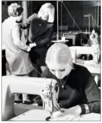
Congratulations to the University of Bolton