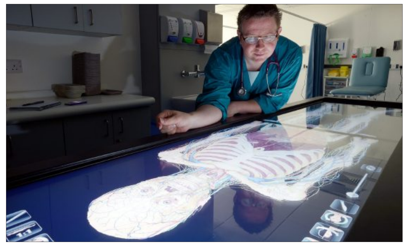
The hi-tech anatomage table allows students to carry out virtual procedures