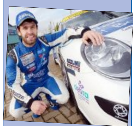
TV star and racing driver Kelvin Fletcher