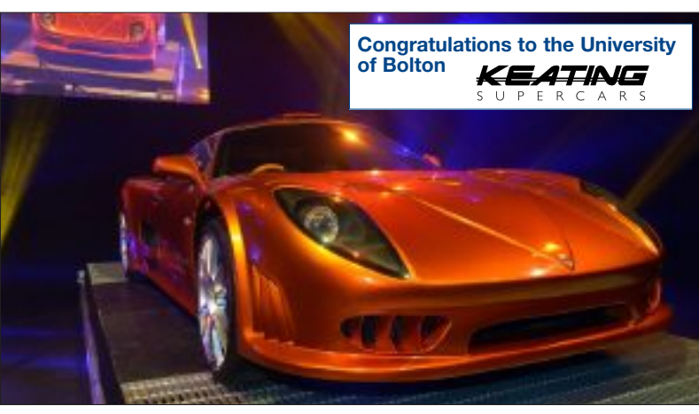
Students work on Keating Supercar 'The Bolt'

subject areas were added to the university's portfolio, helping to create the all-round academic provision expected