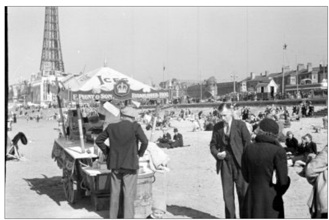
Blackpool, from the Worktown archive of photographs produced for the Mass Observation project in the 1930s