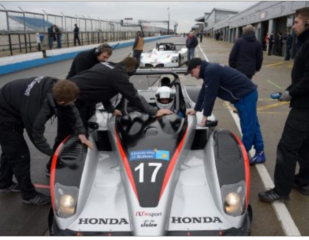
The new Centre for Advanced Performing Engineering (CAPE) is a high-performance engineering centre

EDUCATION for working people has been the driving force of the University of Bolton since its first days as a mechanics' institute in the 1820s. And while buildings,