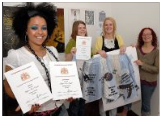
Textiles students scoop national prizes every year

of a modern university. Business and managementstudies, accountancy, law, computing and information technology, biological and environmental sciences, construction and health studies all expanded during this decade.